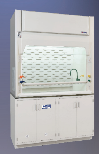
UniFlow SE AireStream High Performance Energy Efficient Laboratory Fume Hoods